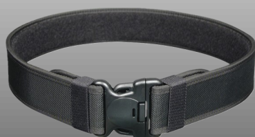
NDuty-FV [Duty Belt 2 1/4"]