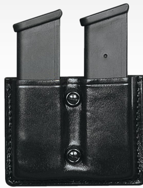
D407 OT [Double Magazine Holder]