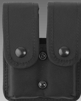
ND407-2S [Double Magazine Holder]