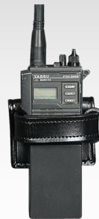
D422 [Adjustable Radio Holder]