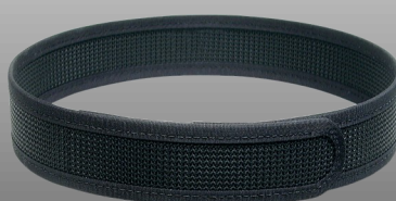
NB125-FV [Trouser Belt 1 1/4"]