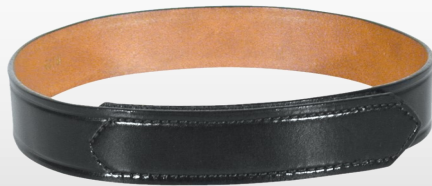
B125 [Trouser Belt 1 1/2"]