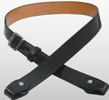
S110 [Shoulder Strap]