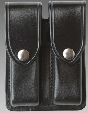
D407 [Double Magazine Holder]