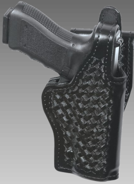
H738-SH [Level One Mid Ride Holster]