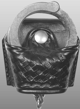
C306-1 [Quick Snap Cuff Case]