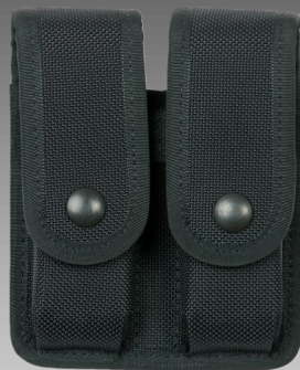
ND407 [Double Magazine Holder]