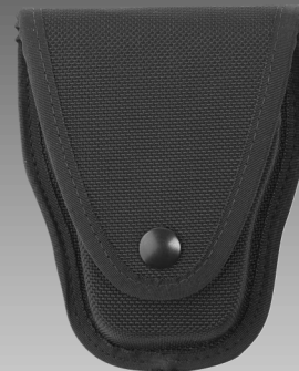
NC300 [Handcuff Case]