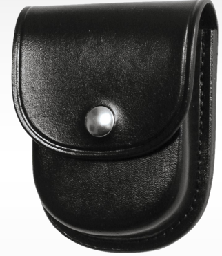
C304 [Handcuff Case]