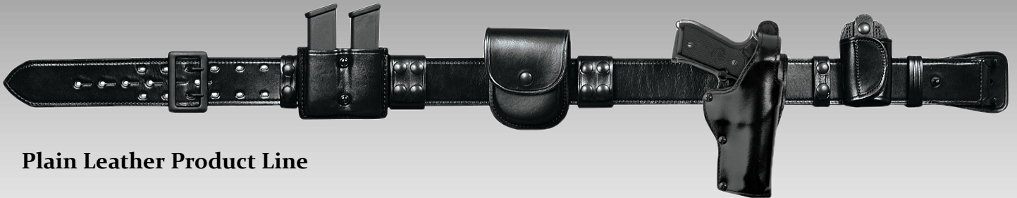
Plain Leather Product Line

Our products are made from the finest materials available and hand crafted with old world traditions, attention to detail from beginning to the finished product. Our customer satisfaction towards design and function is always our goal.