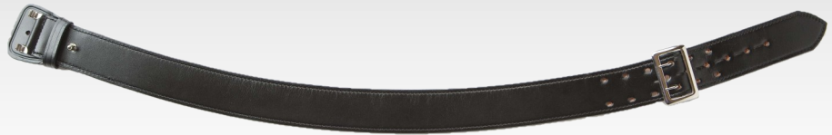
B101-L-SL [Sally Browne Belt 2 1/4"]