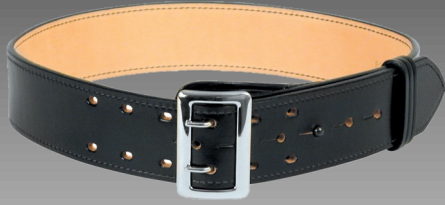
B101 [Sam Browne Belt 2 1/4"]