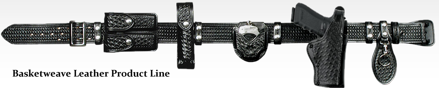
Basketweave Leather Product Line