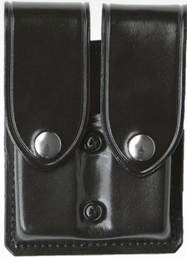
D407-2S [Double Magazine Holder]