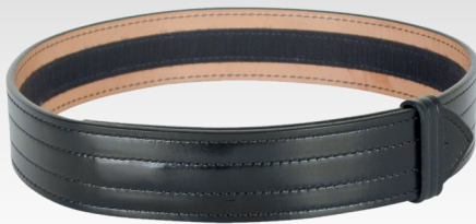
B120-FV [Buckleless Belt 2 1/4"]