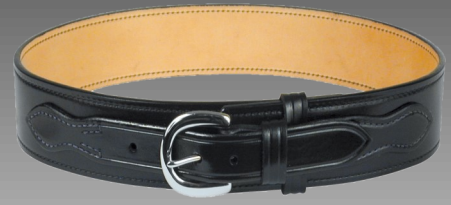
B106 [Border Patrol Belt 2 1/4"]