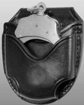
C305-M [Open Handcuff Case]