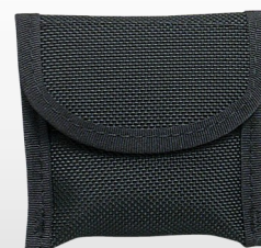
NSBC321-1 [Glove Pouch]