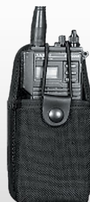
ND.H. [Radio Holder]