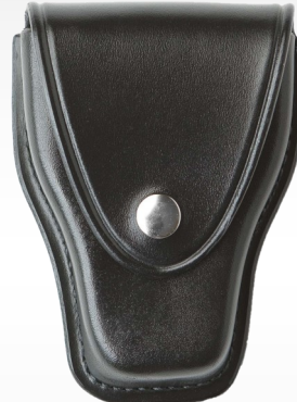
C303 [Handcuff Case]