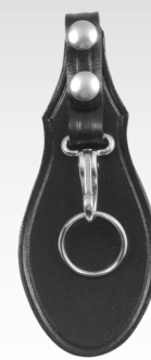
S503 [Key Strap with Flap]