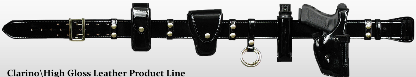
Clarino\High Gloss Leather Product Line