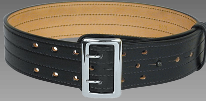
B101-A [Sam Browne Belt 4-Row 2 1/4"]