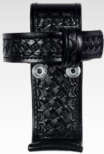
D422-M-S [Adjustable Radio Holder]