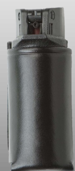
C309 OT [OC/Mace Spray Holder]