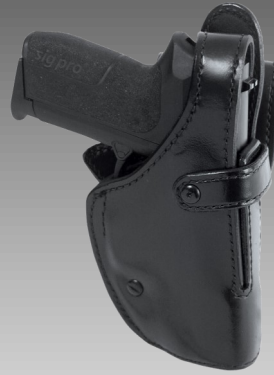
H746-SH [Level Two Mid Ride Holster]