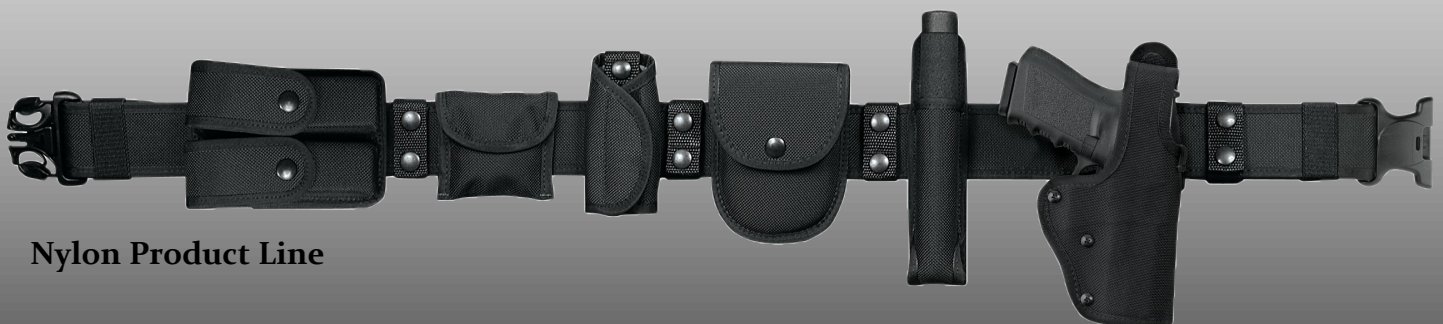
Nylon Product Line

SEE OUR WEBSITE WWW.DONHUME.COM FOR MORE PRODUCTS AND PRICING