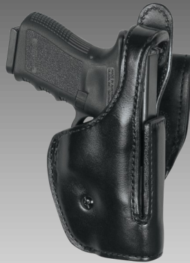
H745-SH [Level Two Mid Ride Holster]