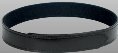
B125-FV [Trouser Belt 1 5/8"]