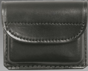
C321 [Glove Pouch]