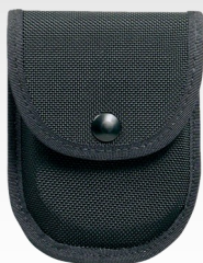
NC304 [Handcuff Case]