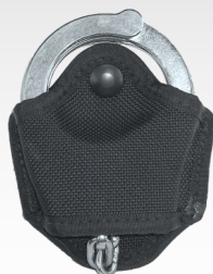
NC306-1 [Quick Snap Cuff Case]