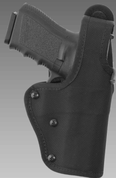
NCOP I-SH [Level One Mid Ride Holster]