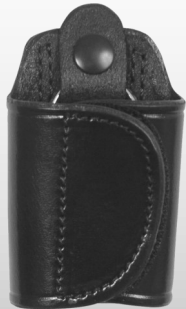
S504 [Silent Key Holder]